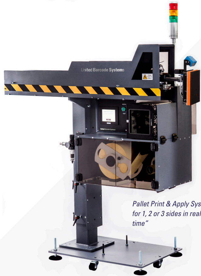
Pallet Print & Apply System for 1, 2 or 3 sides in real time"